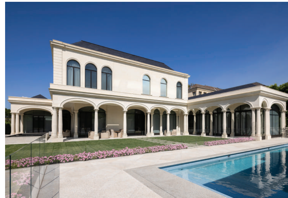
The Colonnade House

Shaped by time, refined by hand, and made to endure.